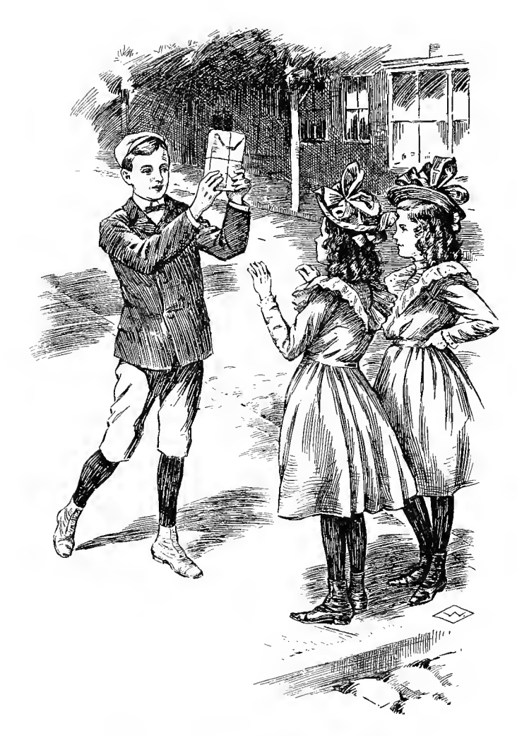
"I GOT IT! I GOT THE PRIZE!" HE CRIED.